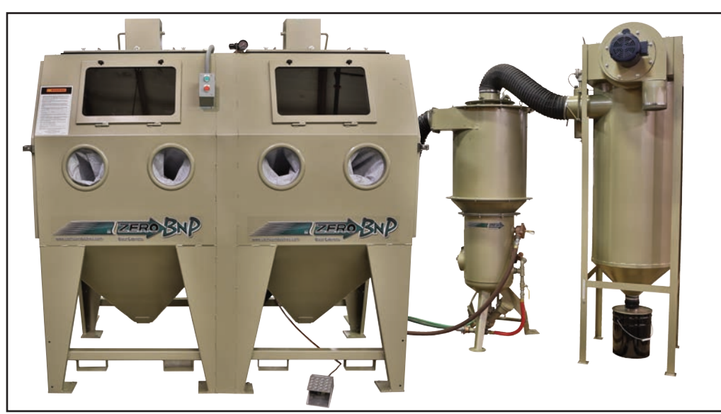
BNP Double 65P with CDC dust collector

For tough cleaning jobs, pressure blasting delivers higher abrasive velocity for greater impact intensity, compared to suction blasting, and can increase your production rate by as much as 300 percent.